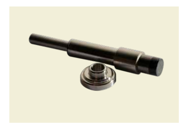
Severe service stem and seat

The JISKOOT SCV for severe service is designed for challenging sampling applications where there are entrained solids or abrasive particulates, which can lead to a reduction in the lifespan of traditional sampling check valves. Proven in severe field trials – specialized stems, seat materials and a customized internal design ensure that this sampling check valve can last three to five times longer than the JISKOOT SCV for rugged service use.