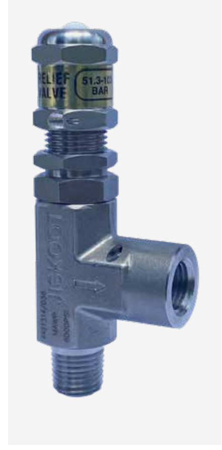
JISKOOT SCV with 1/4" NPT Connections