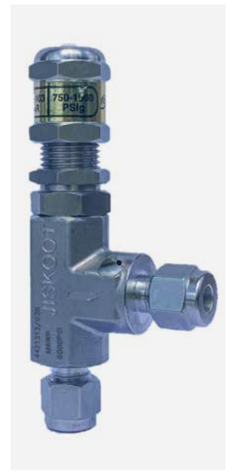
JISKOOT SCV with 1/4" Tubing Connections

With both ¼" NPT pipe fittings and ¼" tubing connections, the JISKOOT SCV can easily replace existing valve configurations in sampling applications. JISKOOT SCV valves can be configured to include a variety of optional seal materials to be implemented in either gas or liquid sampling. In addition a conventional safety relief valve can used in conjunction with the JISKOOT SCV to protect the tubing, switching valves, receivers and other components that are downstream of the sampler.