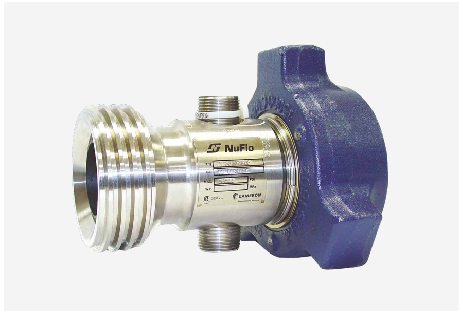
NUFLO 1502 WECO Union high-pressure liquid turbine flowmeter

As liquid flows through the meter and over the rotor, the rotor turns at a speed that is directly proportional to the flow rate. A magnetic pickup senses the rotor blades as they pass and generates an electrical (sine wave) signal. Then, these electrical pulses are transmitted to the flow measurement readout equipment. Optional rotor configurations and finishes enable the metering of erosive or corrosive fluids such as mud or cement slurries and acids. The meter should be flushed with clean water following the use of any erosive or corrosive fluids.