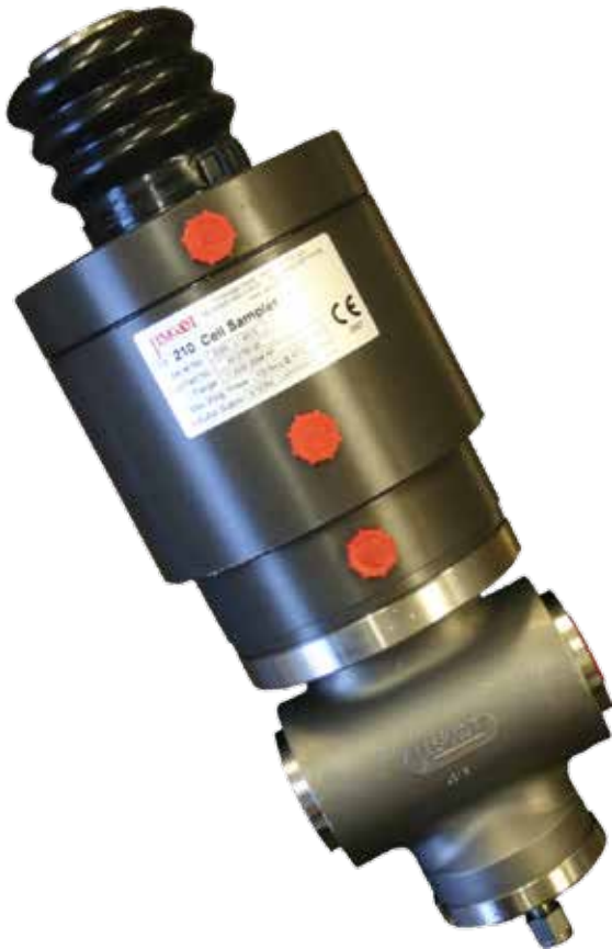
210 Cell Sampler