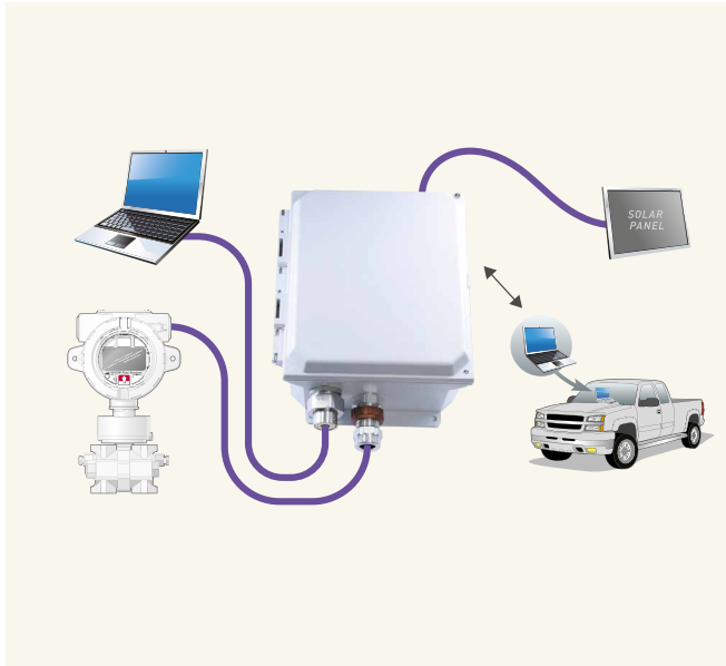
Solar/Wi-Fi Accessory Package