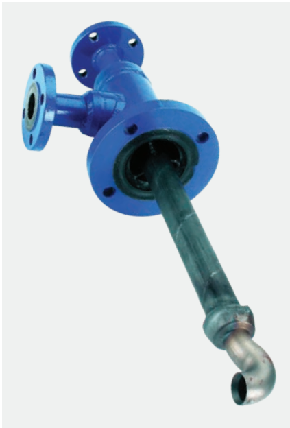
JISKOOT ByScoop sample extraction probe

Hydraulic extractors are available to allow the withdrawable JISKOOT ByScoop probe to be removed from the pipeline without depressurizing.