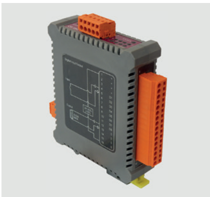
A wiring diagram is conveniently located on the side of each remote I/O module.

The remote I/O modules are bundled and configured for integration into an existing or new JISKOOT InSpec sampling system. Each module provides eight channels of I/O. A maximum of four modules (in various I/O combinations) can be packaged in a hazardous-area hub. The JISKOOT InSpec controller's web-based interface makes it easy to configure, calibrate, and perform simple diagnostic tests on each module. Only an Ethernet connection and IP address are needed to connect to the controller.